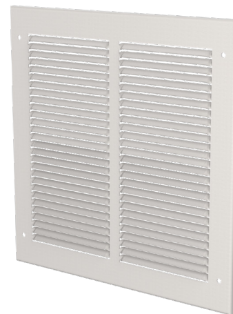
Mild steel grille