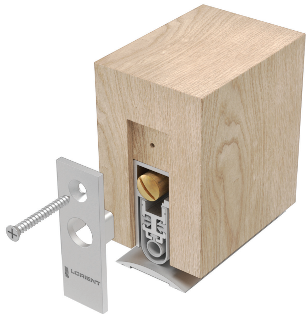
▲ LAS8014 si (shown with LAS4002)