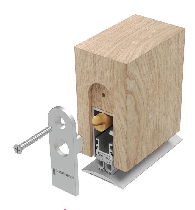
LAS8013 si (shown with LAS4002)