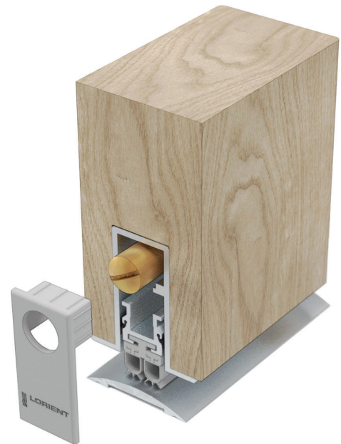
LAS8012 si (shown with LAS4002)