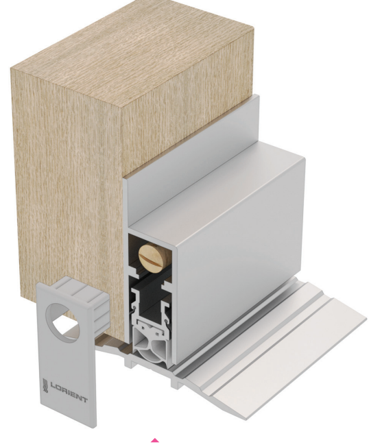
LAS8006 si (shown with LAS4010)