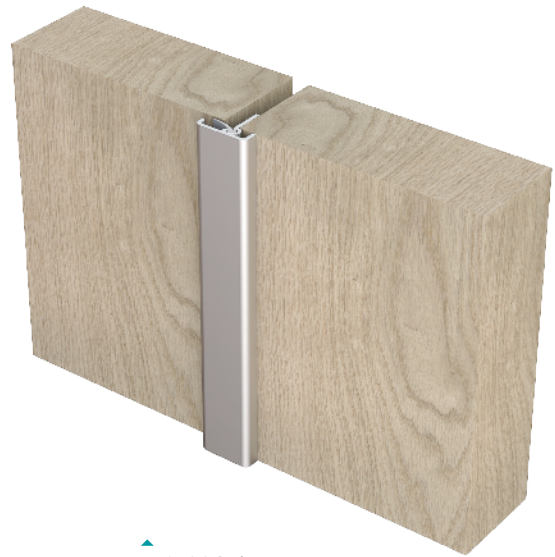
▲ LAS7006 si