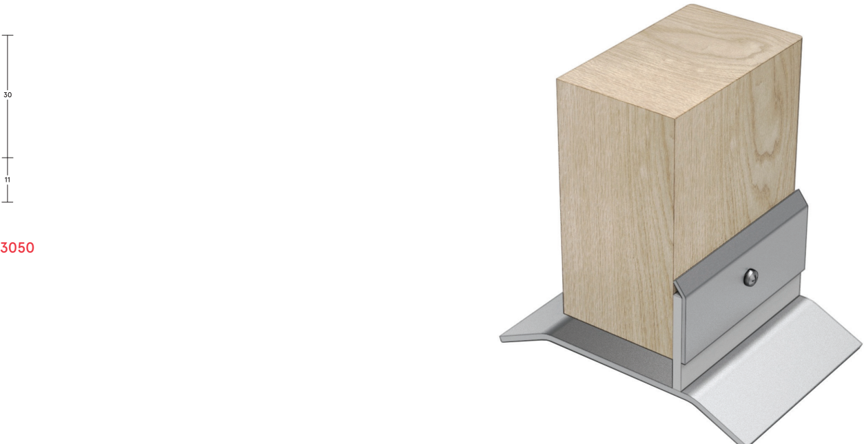
LAS3050 (shown with LAS4050)