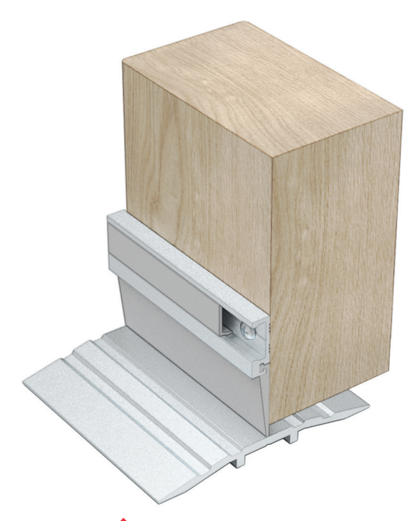
LAS3004 si (shown with LAS4010)