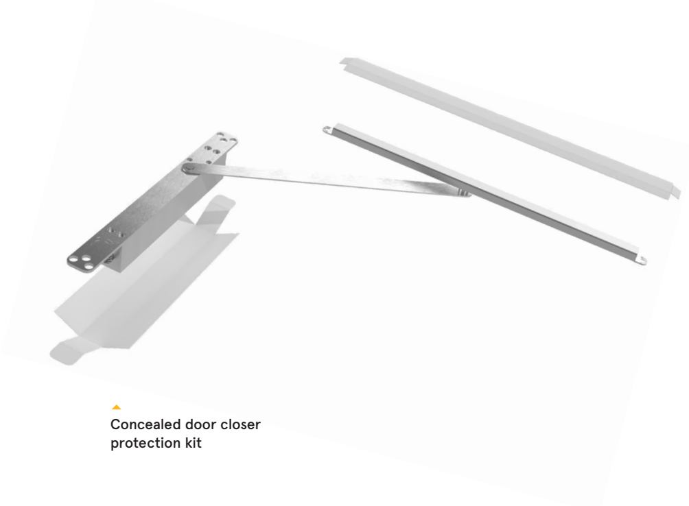
Concealed door closer protection kit