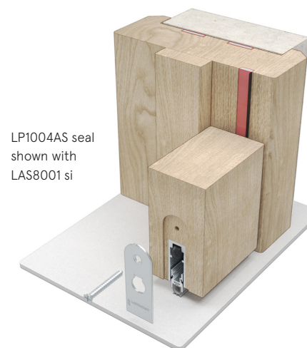
LP1004AS seal shown with LAS8001 si

The products do not fall within the scope of COSHH regulations. Lorient intumescent seals should be stored flat in a clean, dry, dust-free area away from heat and at a storage temperature of between 5°C and 40°C.